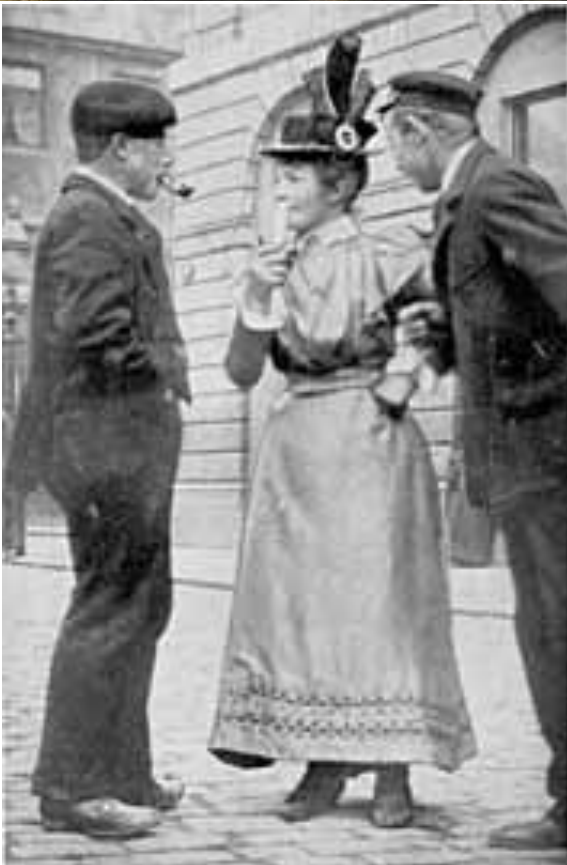
19th Century Aberdeen street scene