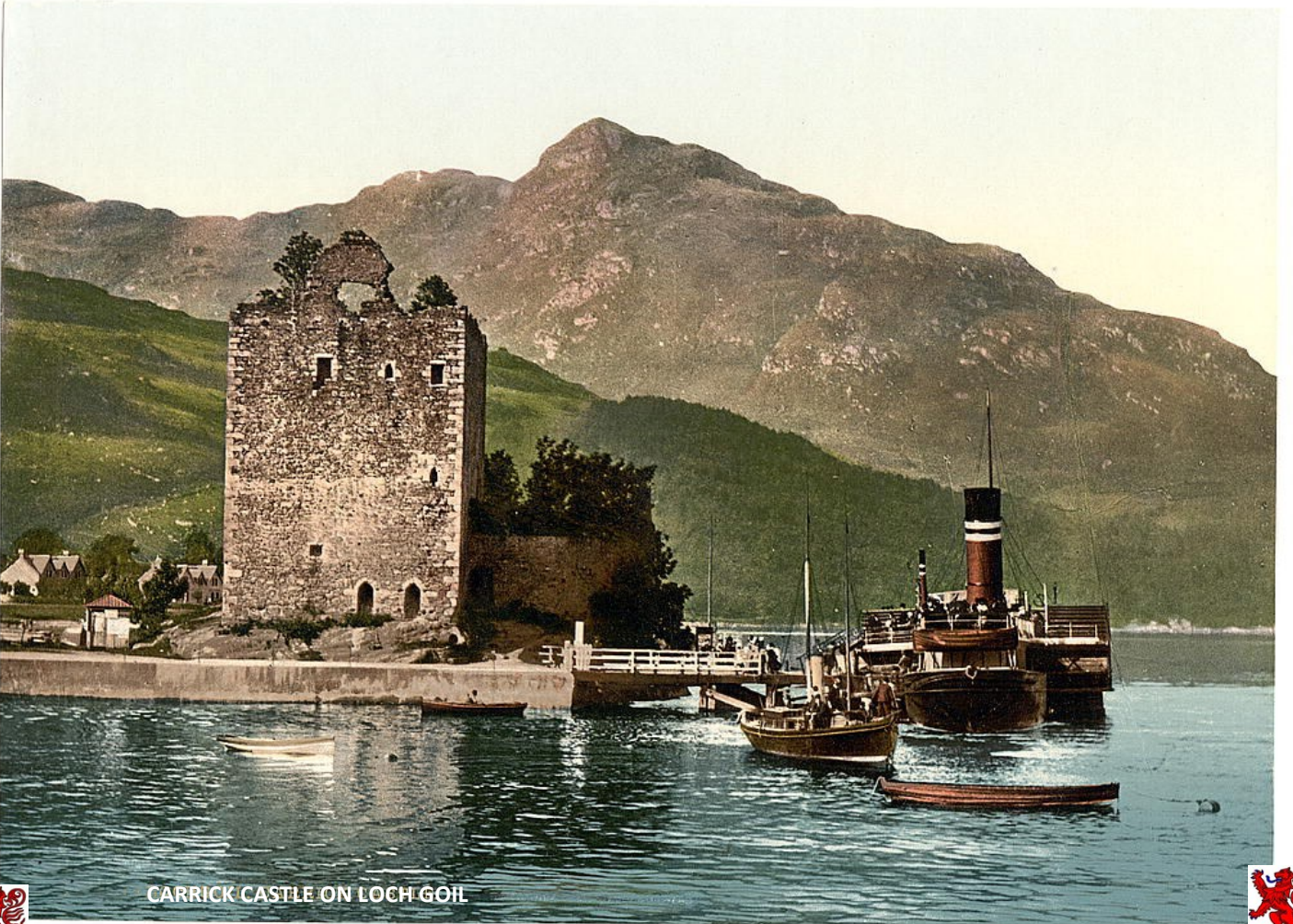
CARRICK CASTLE ON LOCH GOIL